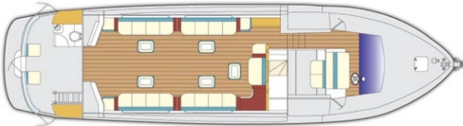
Interior lay-out and exterior top view